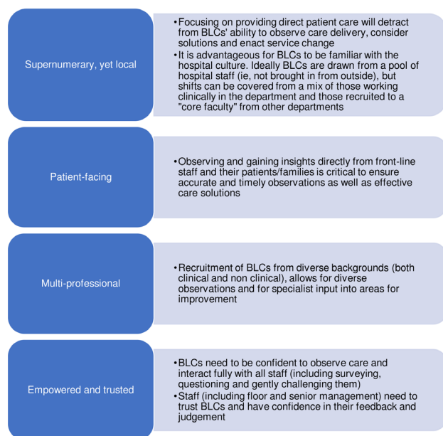
Figure 2 Maximising the value of the Bedside Learning Coordinator (BLC) role. Alongside operating within a broader learning system, we suggest that the above components are likely to be needed to get the full value from the BLC role.